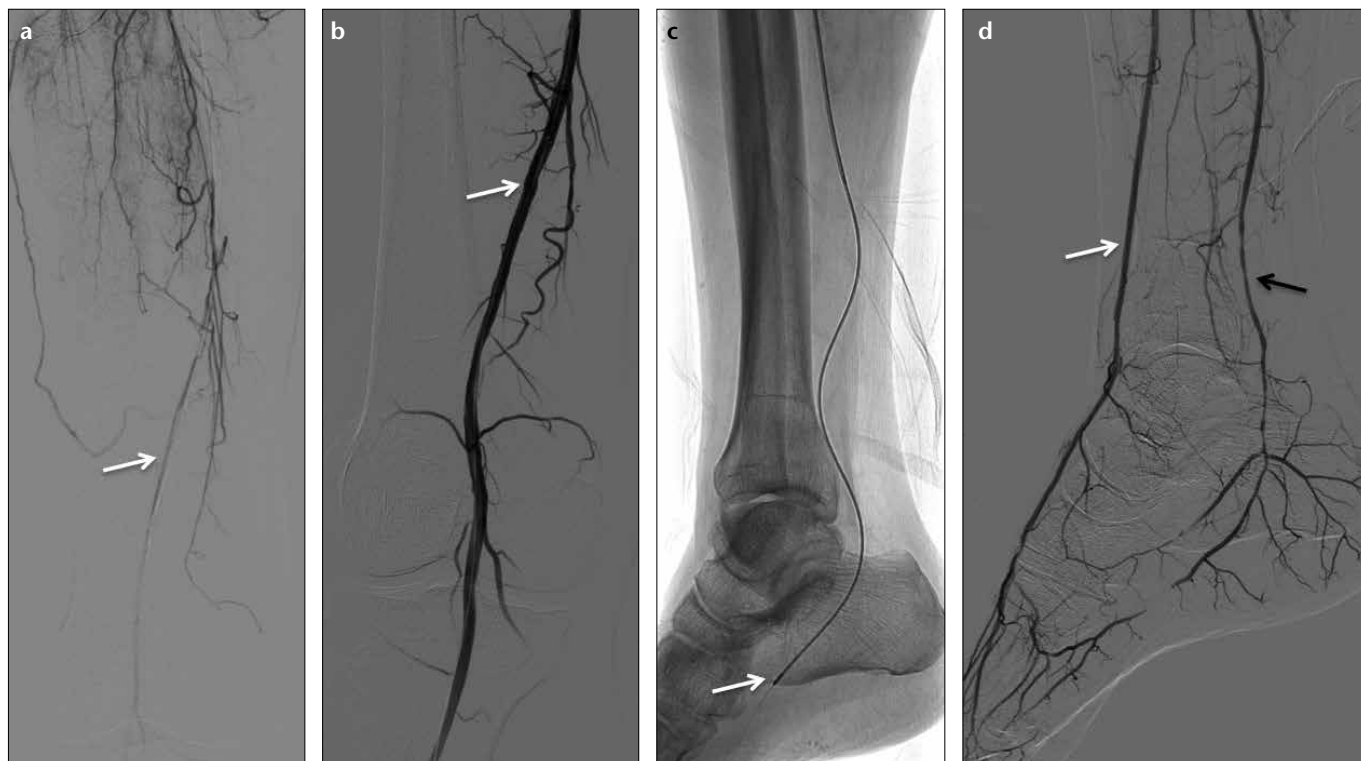
Figure 2. a–d. A 62-year-old patient being investigated for nonhealing ulcerations in the foot. DSA (a) demonstrates complete occlusion of the superficial femoral artery with extensive collateral vascularization and reconstitution of the distal outflow as indicated by the white arrow. Superficial femoral artery (b) was revascularized (white arrow) following extensive percutaneous transluminal angioplasty (PTA) and placement of a covered stent. Run-off to the foot (c) proceeded via the peroneal artery. Both the anterior and posterior tibial arteries were revascularized using a combination of PTA and atherectomy. The atherectomy device is indicated by the white arrow (c). DSA (d) demonstrates marked improvement of flow to the foot via successful revascularization of the anterior (white arrow) and posterior (black arrow) tibial arteries.

In conjunction with these dismal prognoses, the advent of new and efficacious treatment options have reshaped patient treatment discussions and have further fueled the debate of the most appropriate CLI treatment strategy: surgical bypass versus endovascular techniques. Although surgical bypass of the infrainguinal arteries us-