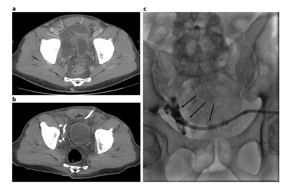
Figure 2. A 57-year-old male with a history of robotic prostatectomy and pelvic lymphadenectomy presenting with pelvic pain. (a) Computed tomography of the abdomen and pelvis showing right pelvic fluid collection (white arrows). (b) Collection completely drained with a 10.5 Fr drainage catheter (white arrow heads), but a consistently high output of 195 cc/day was noted for the following 2 weeks. (c) The residual cavity filled with 12 cc of contrast with no evidence of communication with the surrounding structures (black arrows). A total of 12 cc of 3% sodium tetradecyl sulphate (STS) mixture (2 mL STS, 8 mL iodinated water-soluble contrast, 2 mL air) was subsequently injected (not shown) and allowed to dwell for 2 hours. Output subsequently dropped to 5 cc/day, and the drain was removed after 7 days.

The procedure was performed under moderate sedation by one of six interventional radiologists with 2-26 years of experience. Under ultrasound imaging guidance, a 25-gauge needle was placed into an inguinal lymph node at the side of the pelvic lymphocele with the tip located at the corticomedullary junction (Figure 3). Bilateral lymph node access was obtained in cases of bilateral pelvic lymphoceles or retroperitoneal lymphoceles. A total of 6 cc of lipiodol (Guerbet, Villepinte, France) was injected by hand under intermittent fluoroscopy. Once the contrast extravasation was noted into the lymphocele, the point of leak was identified. LE was then performed by advancing a 20- or 22-gauge needle into the leaking lymphatic vessel or the closest proximal lymph node under fluoroscopic guidance (Video 1). An injection of dextrose 5% through the 22-gauge needle with the clearing of the lipiodol in the lymphatic vessel confirmed access (Video 2). LE was then performed using a mixture of lipiodol and n-BCA (Trufill; Codman Neuro, Raynham, Massachusetts) (Video 3). The di-